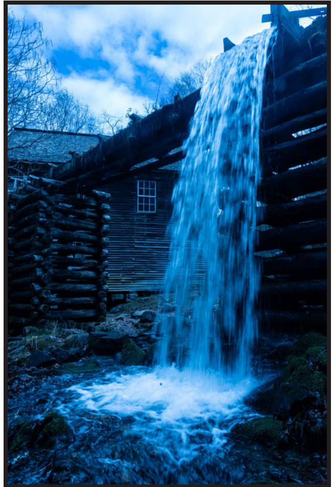
Improper White Balance